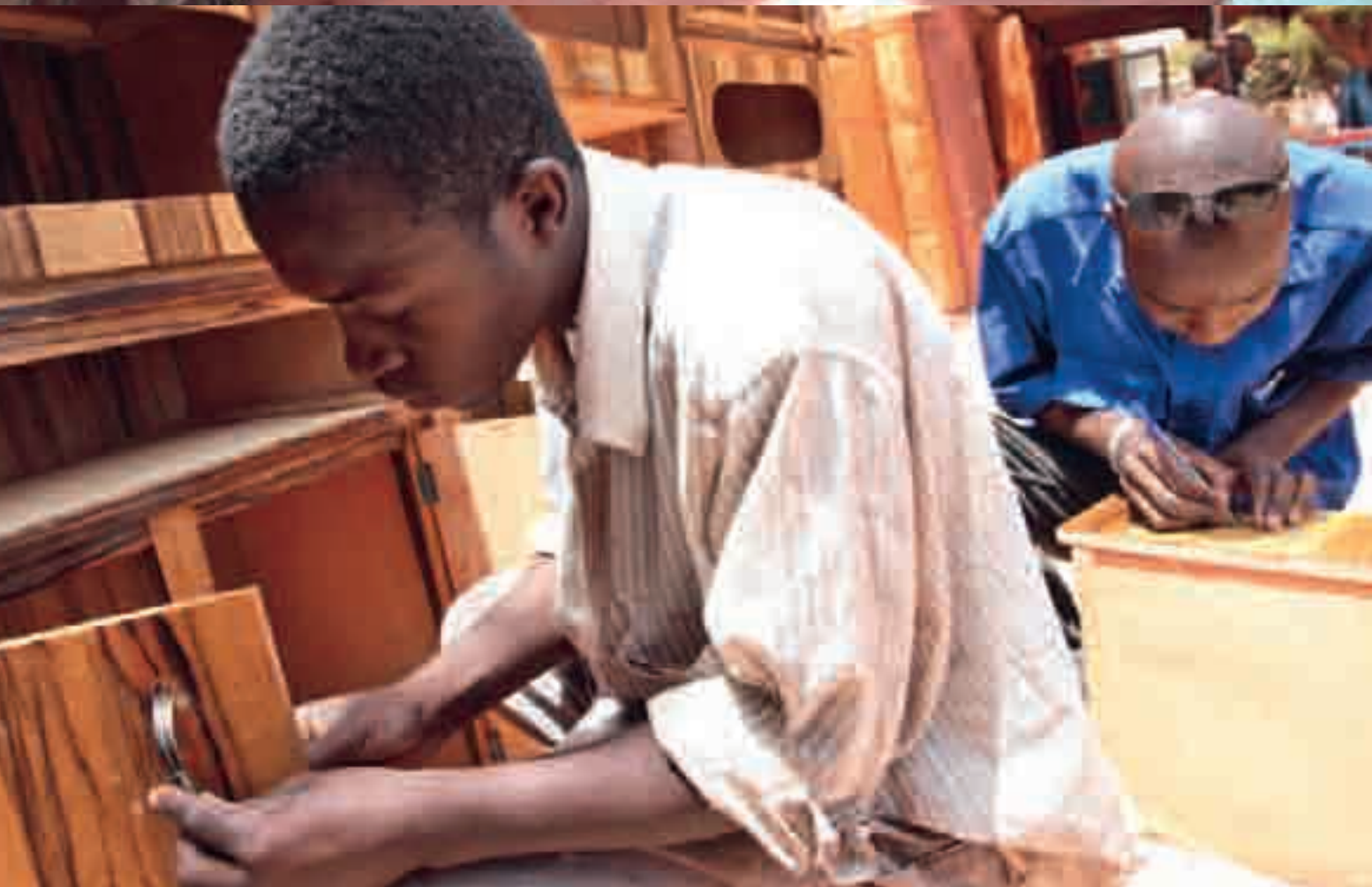
Young people active in skills training in Burkina Faso. UNV volunteers support underprivileged youth overcome poverty by providing access to skills training in such areas as tailoring and woodworking.