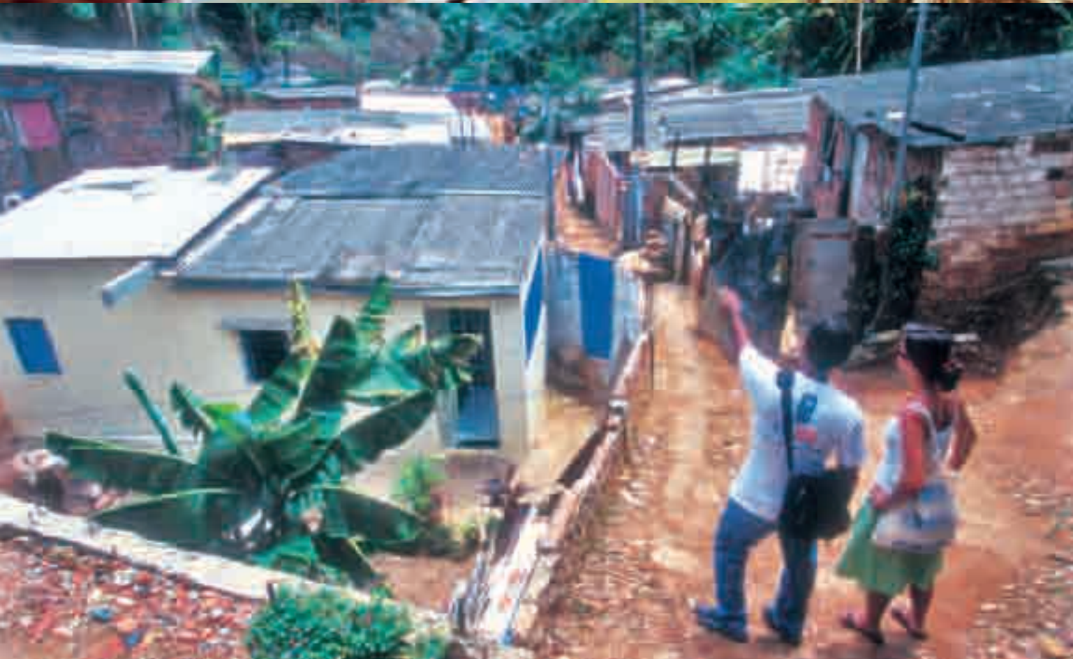
Above: A health volunteer checks an elderly woman's vital signs at a volunteer-run health centre in Banda Aceh, Indonesia. The centre was the result of a partnership between the NGO Yayasan Bina Mandiri and UNV following the December 2004 Indian Ocean tsunami.