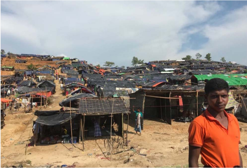
Makeshift camps in Cox's Bazar, Bangladesh.