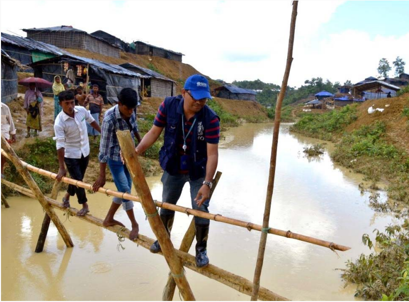
A WHO staff and locals crossing a bamboo bridge to access remote areas around Cox's Bazar.

With his camera in hand, Catalin carefully captures the work of WHO's team delivering medical support, and the mixed sense of anxiety, exhaustion and relief on the face of the women, men and children receiving care.