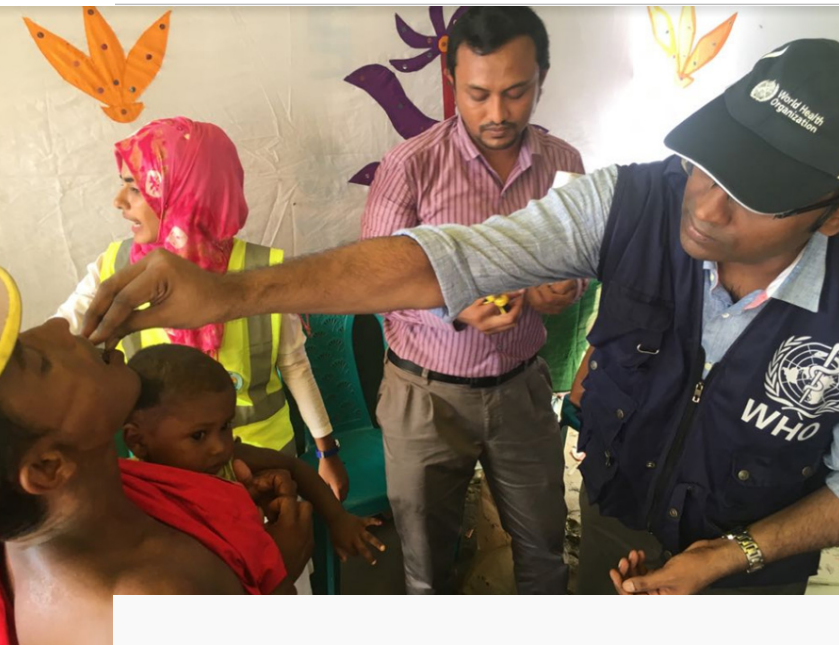
An immunization campaign in Cox's Bazar, Bangladesh (2017).