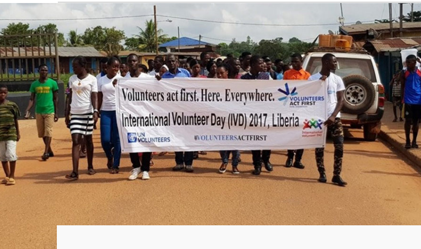
IVD celebration in Zwedru City, Liberia (UNV, 2017).