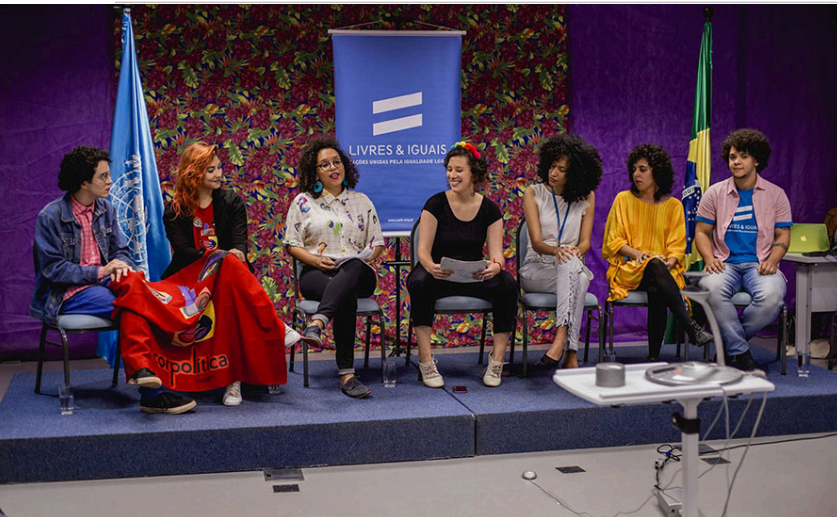
Workshop about the United Nations and LGBTI rights with LGBTI activists in Brazil in 2016.