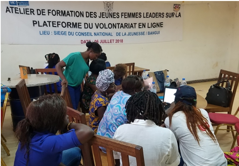
Capacity-building training for young women leaders in Bangui on the UN Online Volunteering service.