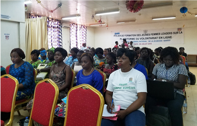
Capacity building workshop for girls' organizations in Bangui, Central African Republic, on the UN Online Volunteering service.