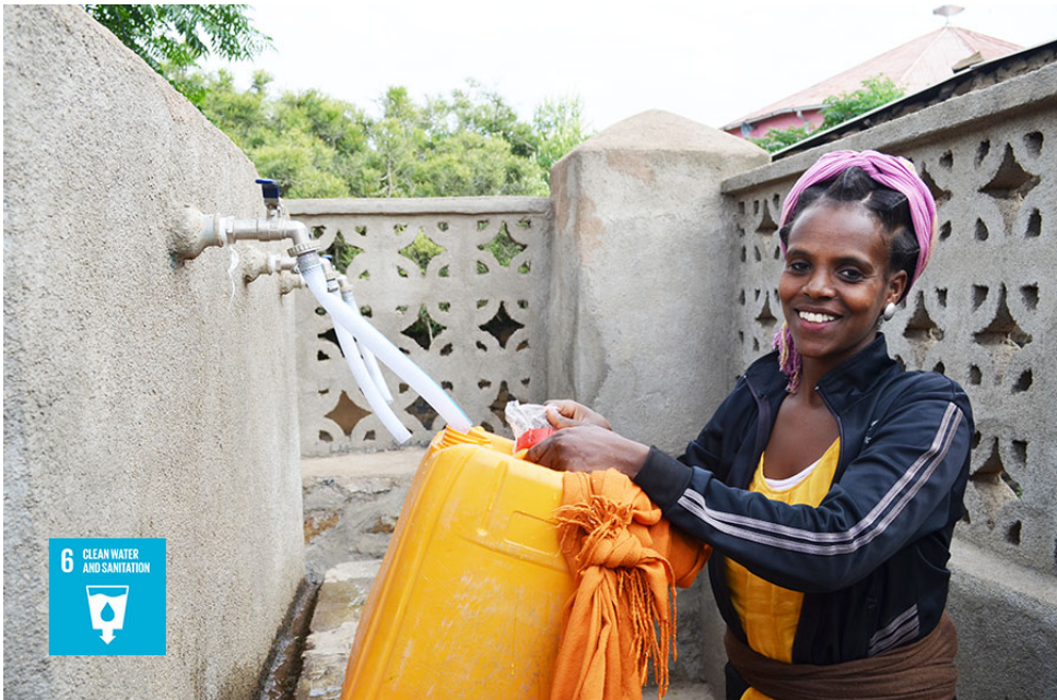
In Eritrea, a lady fetches water in Dehub region.