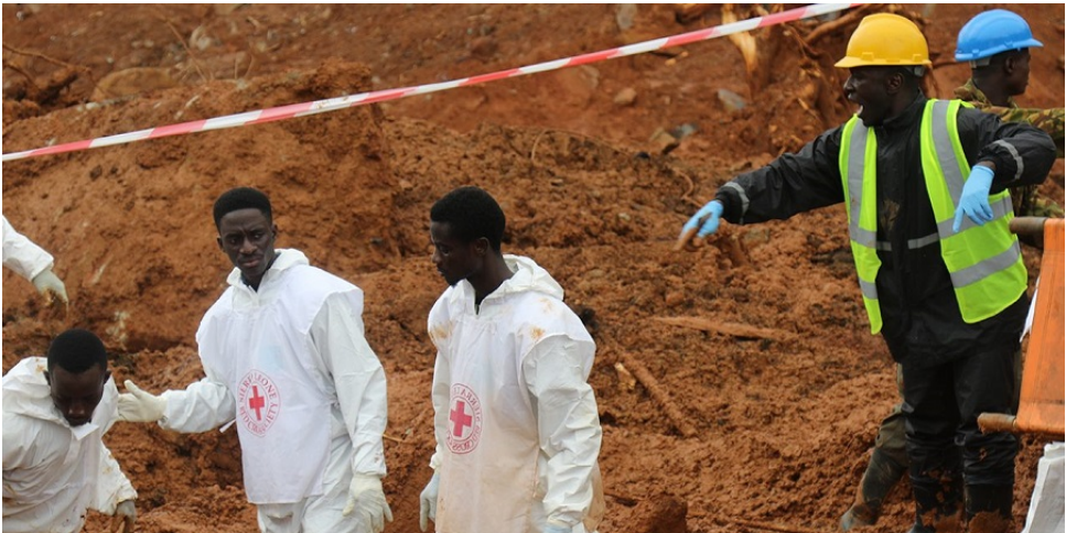
Red Cross volunteers in Sierra Leone (2017).