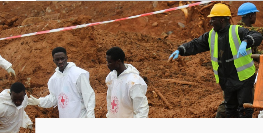
Red Cross volunteers in Sierra Leone (2017).