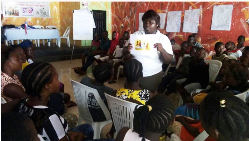
Child protection efforts in the aftermath of the Sierra Leone

UNICEF also led the family tracing and reunification (FTR) sub-committee to better coordinate the process whereby children who are unaccompanied or have become separated from their families are identified and reunified with their families, or to their previous primary caregivers, as well as a mental health and psychosocial support (MHPSS) sub-committee which bridged the gap between the PSS providers and mental health nurses.