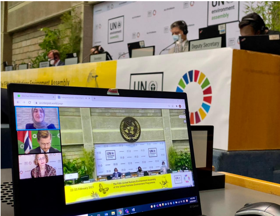
The fifth UN Environment Assembly (UNEA 5) convened as a hybrid online-onsite events.