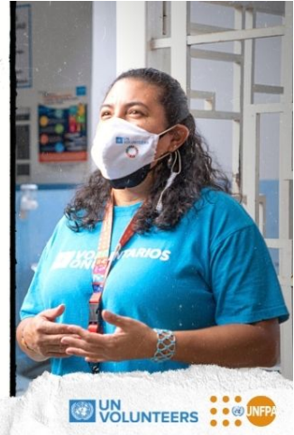
UN Volunteers serving with UNFPA in Latin America and the Caribbean.