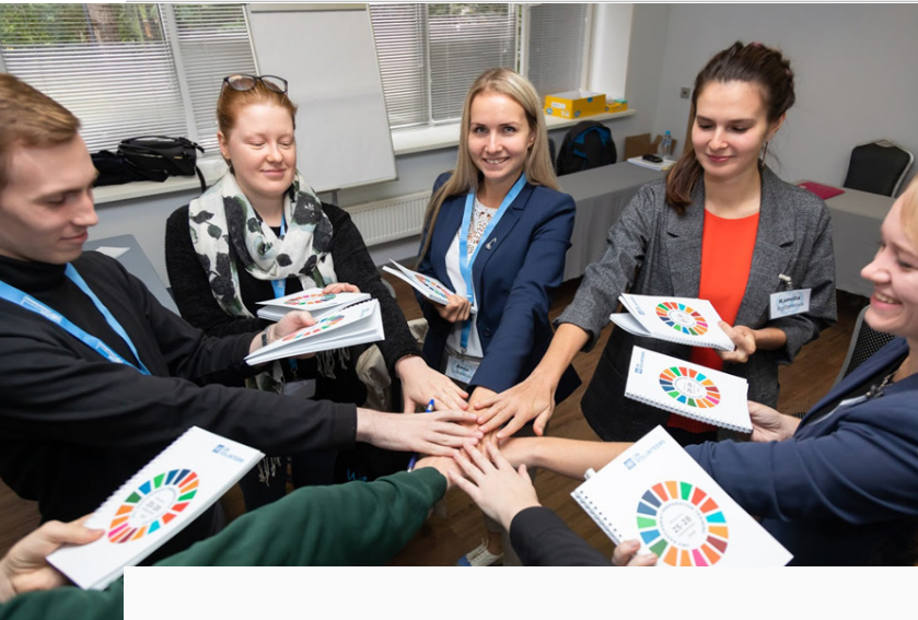
Russian UN Youth Volunteers during one of the sessions at their assignment preparation training in Moscow.