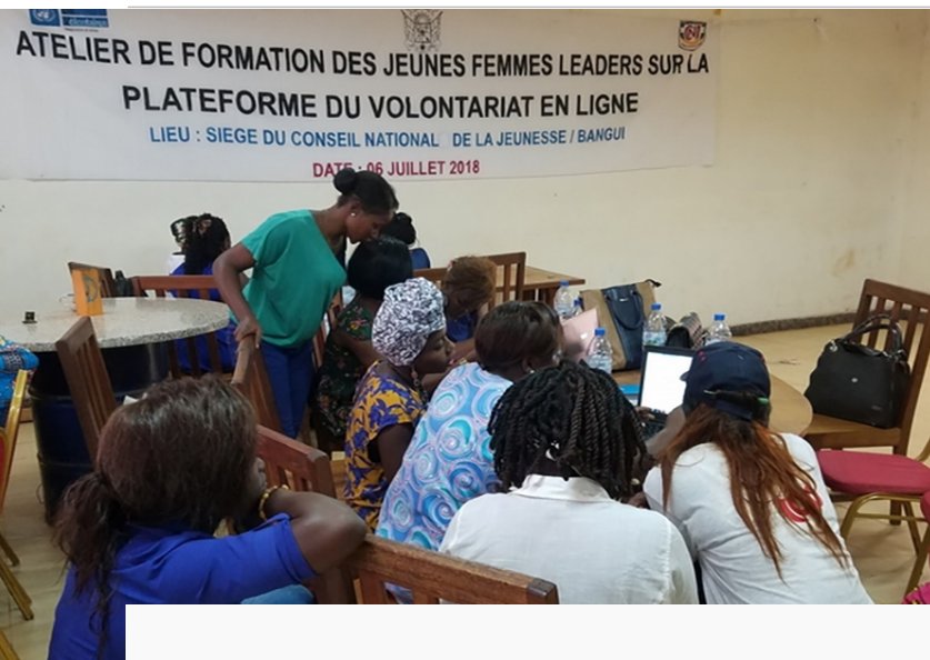
Capacity-building training for young women leaders in Bangui on the UN Online Volunteering service.