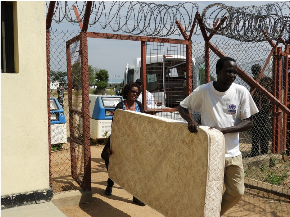
UN Volunteers in Bor provide bedding supplies for Bor Central Prison. (UNV, 2017)