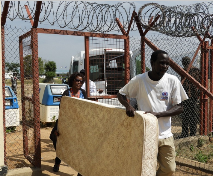
UN Volunteers in Bor provide bedding supplies for Bor Central Prison. (UNV, 2017)