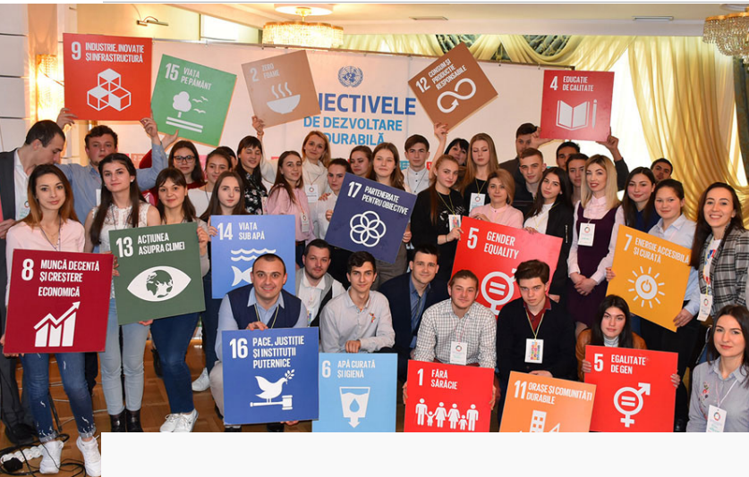
Participants in the National SDGs Youth Consultation workshop in the Republic of Moldova, April 2019.