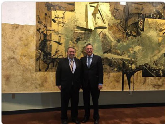
6:16 PM · Aug 30, 2019 · Twitter for iPhone