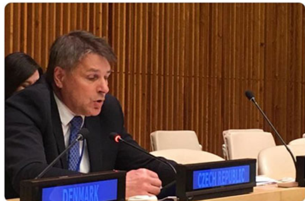
12:13 AM · Jun 7, 2019 · Twitter Web Client

"#CzechRepublic sincerely acknowledges the dedication of 7,000 UN Volunteers to #peace and #development. We recognise UNV and UNDP as priority partners." -- @CzechUNNY @UNDP Ex. Board. @CzechMFA