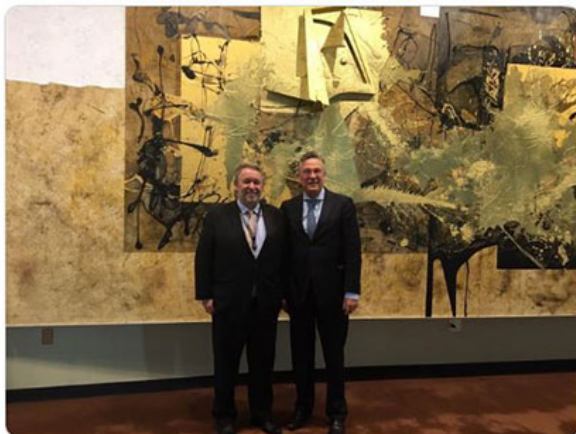
6:16 PM · Aug 30, 2019 · Twitter for iPhone