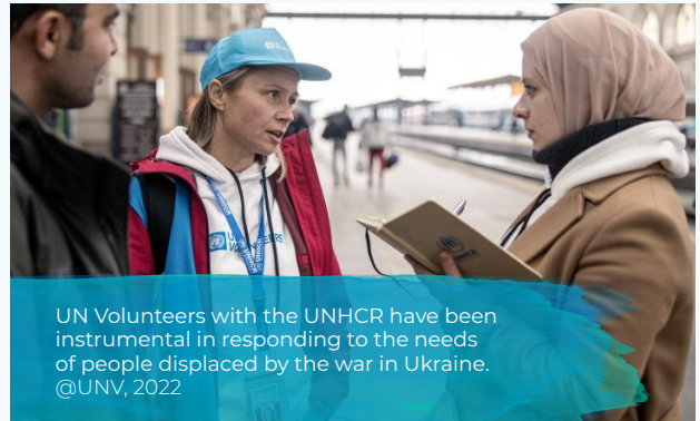
UN Volunteers with the UNHCR have been instrumental in responding to the needs of people displaced by the war in Ukraine.