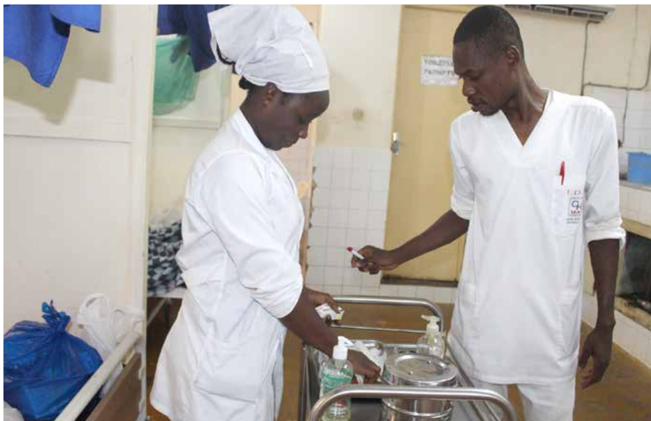
Volunteers assigned to a hospital in Côte d'Ivoire under the national volunteer programme. (Bertrand GUEU, UNV 2018)

In India, a draft state youth policy was formulated and shared with three states: Tripura, Uttarakhand and Gujarat. In partnership with the Ministry of Youth Affairs and Sports, UNV supported the strengthening of national volunteer infrastructure in 29 districts through a network of youth clubs. This included thematic debates on the SDGs, skills training programmes, community awareness campaigns, district youth conventions and sports competitions. In addition, large numbers of youth volunteers were mobilized to support programmes being implemented by district authorities in the areas of health, sanitation, education, nutrition, women's empowerment, child protection, and digital and financial literacy.