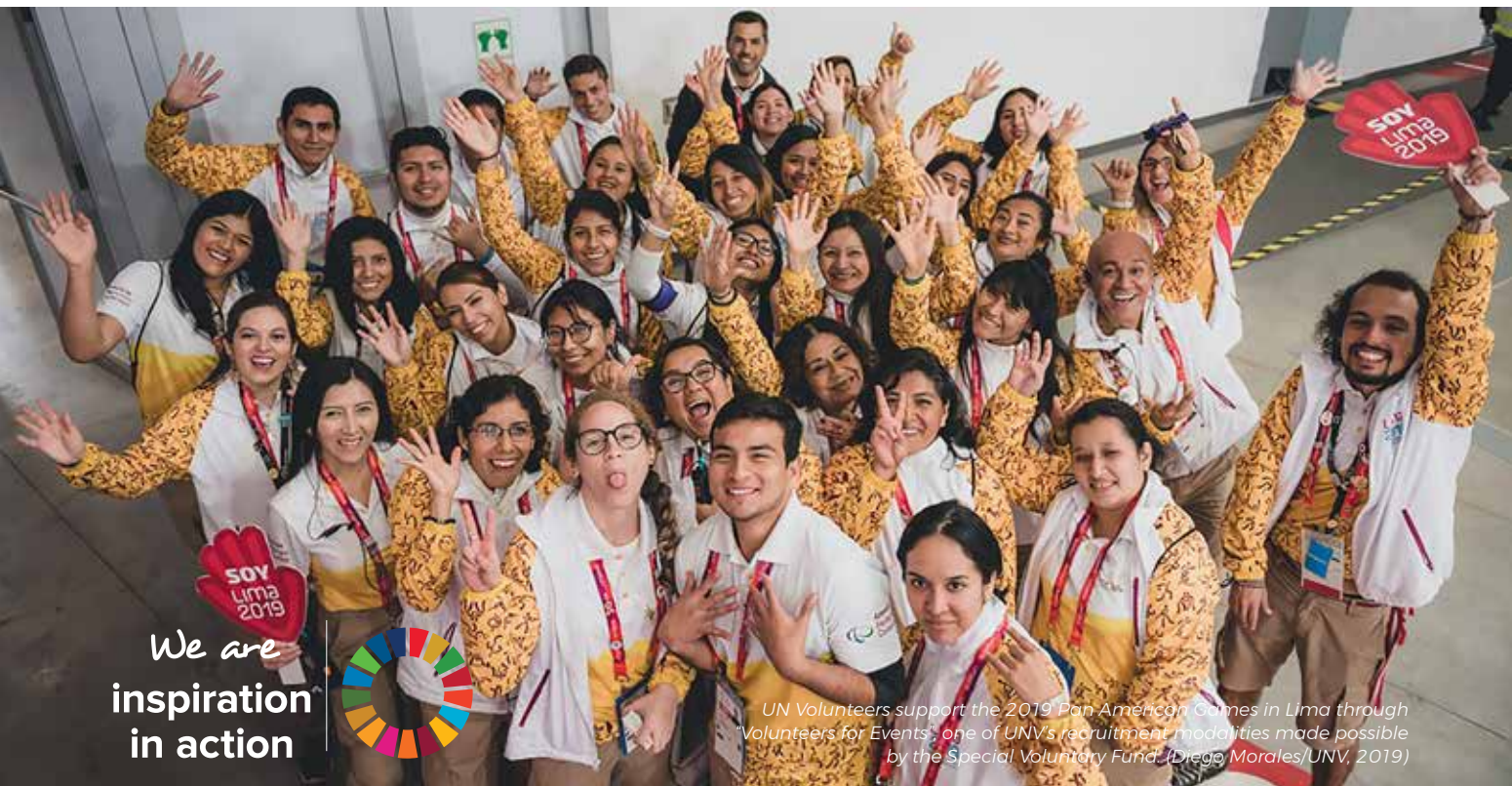
UN Volunteers support the 2019 Pan American Games in Lima through 'Volunteers for Events', one of UNV's recruitment modalities made possible by the Special Voluntary Fund.

The Special Voluntary Fund ( SVF ) is an open trust fund comprised of financial contributions from Member States. The SVF is an essential resource for the United Nations Volunteers ( UNV ) programme, allowing UNV to flexibly and strategically allocate resources to deliver its dual mandate: to promote volunteerism for the 2030 Agenda and to deploy volunteers to support the United Nations.