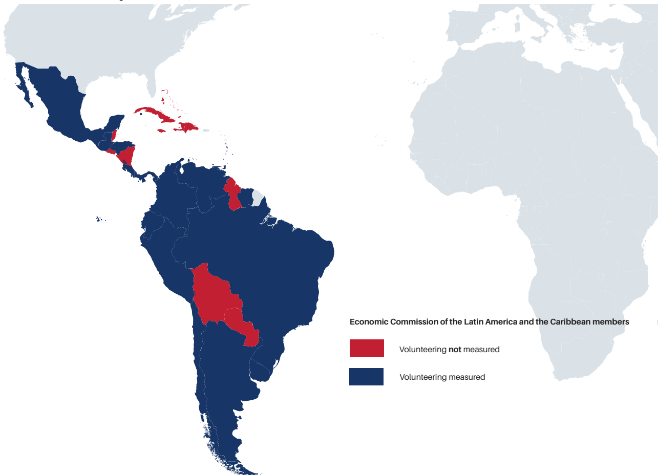
Figure 5 Geographical distribution of ECLAC (Economic Commission of the ) countries by experience in measuring volunteer work, 2008-2017.

As the trends and analysis in the above sections show, volunteering is increasingly recognized as an important means to engage people in sustainable development efforts. However, there is a notable gap in measuring volunteering. Data on volunteers, including