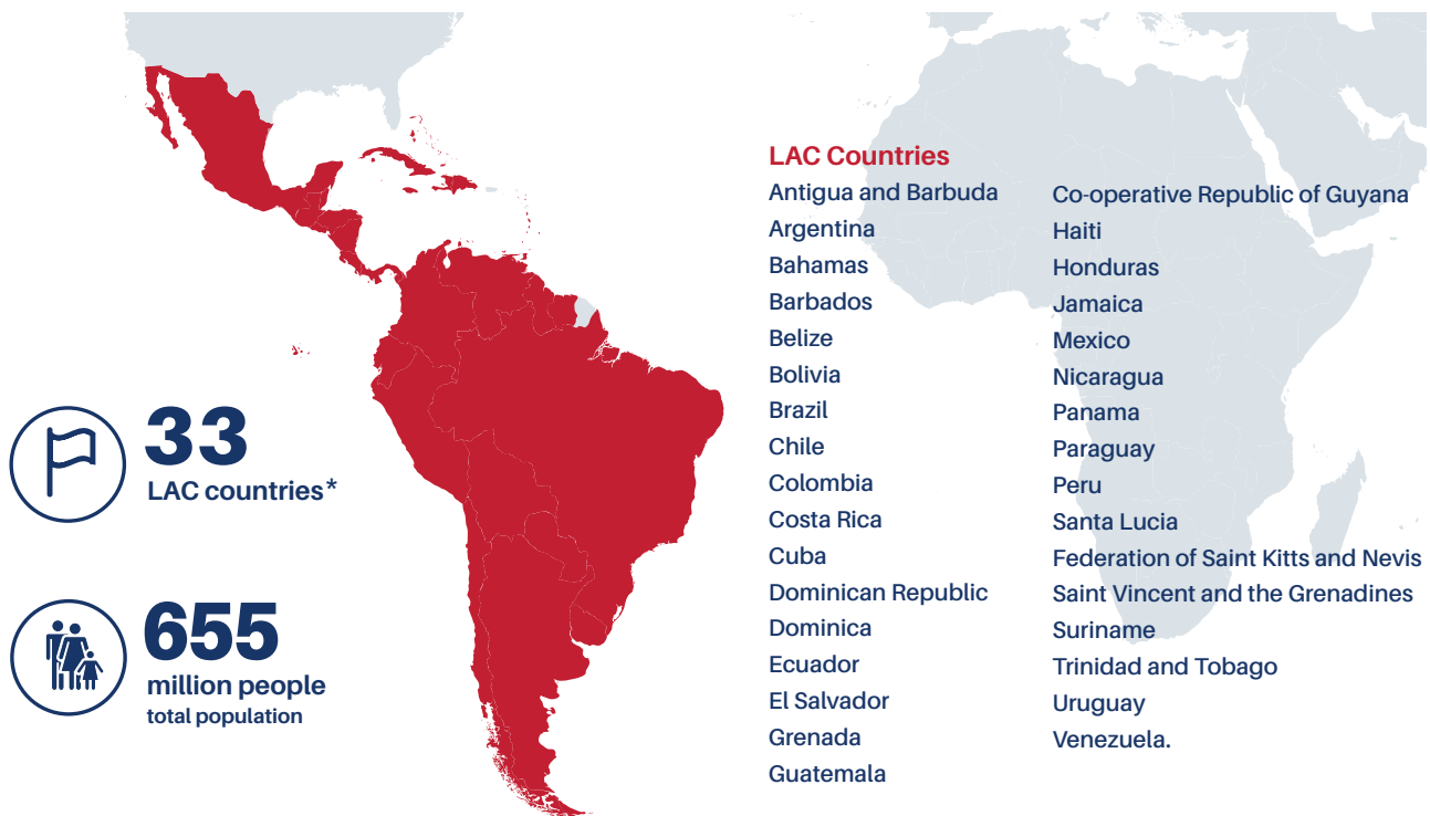
Figure 3 Map of the 33 countries of the Latin America and the Caribbean region.

Across the Latin America and the Caribbean region, Member States are taking steps to achieve the SDGs by 2030. 6 At least 20 of the 33 countries have established institutions and mechanisms to coordinate SDG implementation and most have begun to link their national development strategies to the goals of the 2030 Agenda. 7 Between 2016 and 2018, 22 Latin America and the Caribbean countries reported on their SDG progress to the High-level Political Forum on Sustainable Development through Voluntary National Reviews. 8