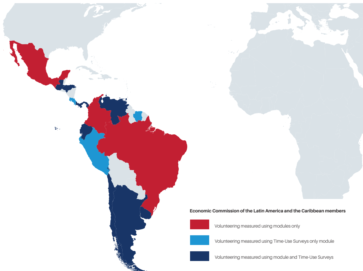
Figure 6 Number of measurements of volunteer work in the Latin America and the Caribbean region, by type of data source, 2008-2017.

Other countries collected data on volunteering through household surveys. For example, the Brazilian Institute of Geography and Statistics collected data on volunteer work in their National Household Sample Survey. The Institute followed International Labour Organization definitions of volunteering and collected data through a mobile electronic collection device. According to the survey data, 4.4 percent of Brazilians aged 14 or above (7.4 million people) volunteered in 2017, which represents an increase of 12.9 percent compared to data collected in 2016 through the same survey. In 2018, Brazil launched a digital platform