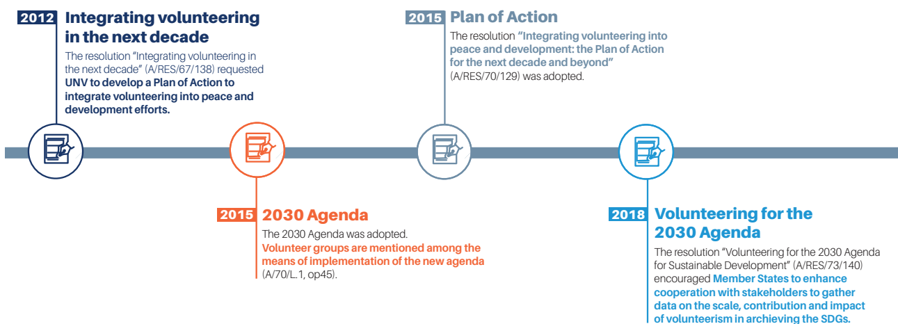
Figure 1 Key United Nations General Assembly Resolutions mentioning volunteering.

Sustainable Development Goals (SDGs). Through the concerted efforts of volunteers, governments, civil society, the private sector and the United Nations, the Plan of Action seeks to strengthen people's ownership of the 2030 Agenda, integrate and mainstream volunteering into national strategies and policies and better measure the impact of volunteers.