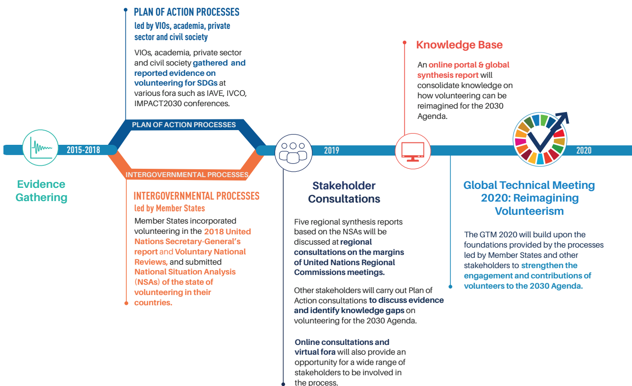
Figure 2 Plan of Action process: Road to 2020 "Reimagining volunteerism"