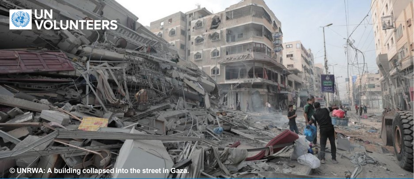
A building collapsed into the street in Gaza.